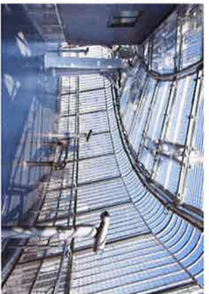
100 m Sky Balcony (Outside Observation Deck)

Take in exhilarating views of the city to the feel of a gentle breeze.