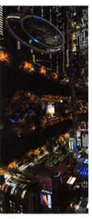
90 m Sky Deck (Inside Observation Deck)

An open-air café in this spacious area beneath the tower gives everyone a place to relax. A beer garden opens here every summer.