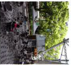
1F Tower Square (Open Area)

An open-air café in this spacious area beneath the tower gives everyone a place to relax. A beer garden opens here every summer.